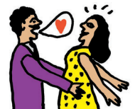
a good film.