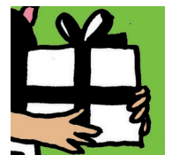
my friend a present.